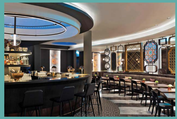
Banaisaanaa Wian Hatal

All lectures will take place in the Renaissance Wien Hotel in Vienna, located just minutes from the world famous Schonbrunn Palace.